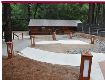
Landscaping between Fireside & Office

Every year, over 20,000 people cross our bridge, and 1,000 of them depart with new life in Christ! For this kingdom impact to continue we must reinvest in our facilities. One area that we would like to improve is the landscaping between Fireside and the office. The area has been remodeled, but needs the finishing touches. For this project to happen, we need to raise $2,500. If you would like to donate to this project or others, please check out our website at www.bridge-to-life.org and click on the 'projects' tab.